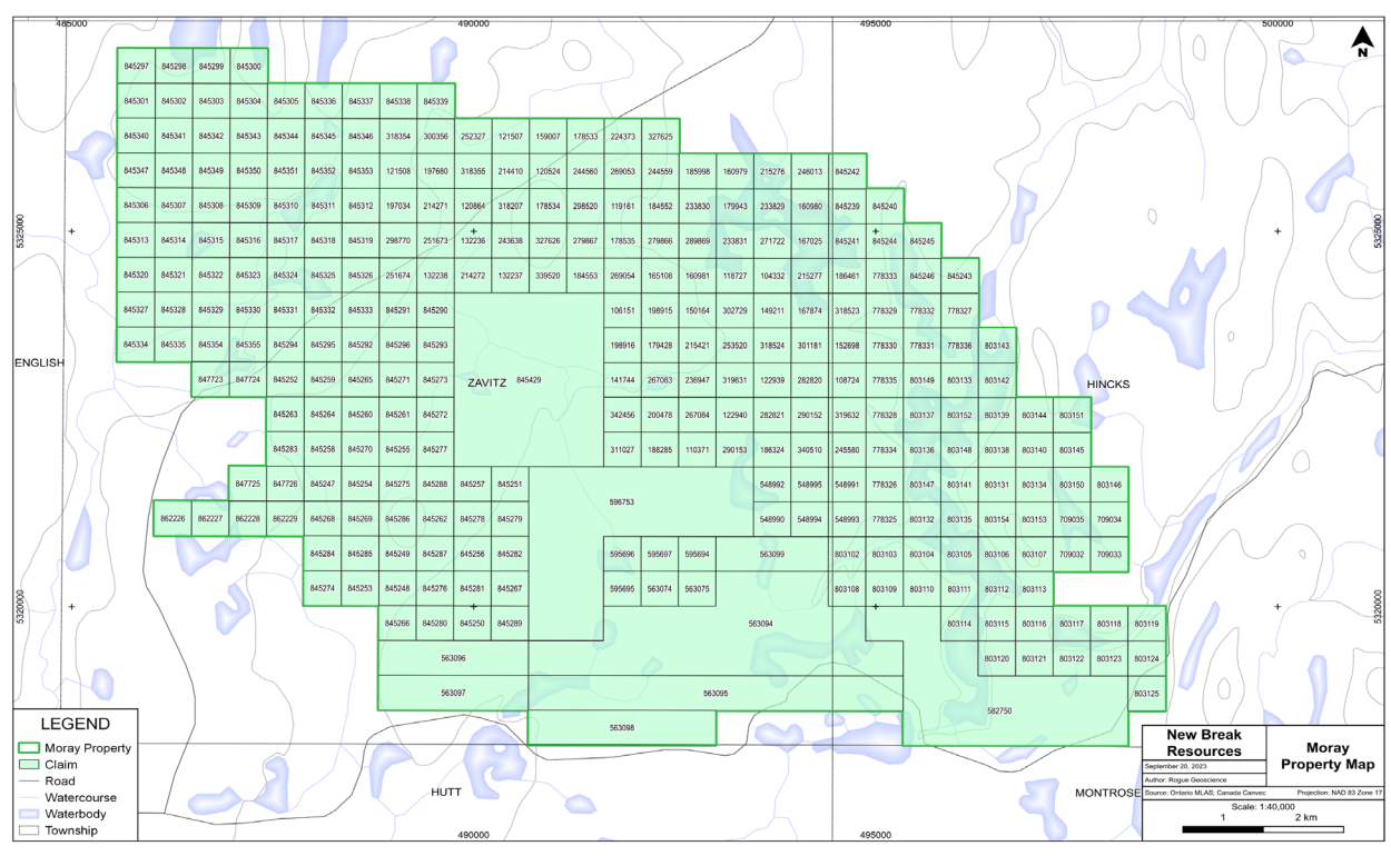
( Figure 1 – Moray Project, property map)

The 8,483-hectare Moray property ("Moray"), is located approximately 49 km south of Timmins, Ontario and 32 km northwest of the Young-Davidson gold mine, operated by Alamos Gold Inc. ("Alamos").